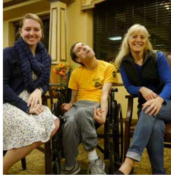
Participants of Connectability's Meet Your Neighbor program

"[The work in my community] taught me a shift from not only doing what's guaranteed to be worthwhile, to engaging in taking risks because that's the rhythm of our work. We could work really hard and spend lots of