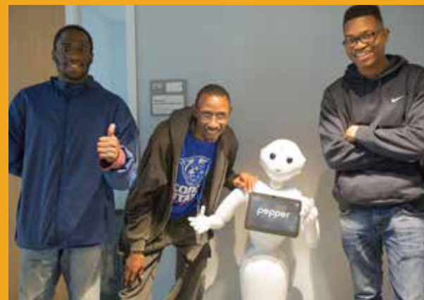
The Fam Squad show off the robot, Pepper, who can dance and

Each member of The Fam Squad talks us through the process of applying to be in the IDEAL program. They said that it took a lot of paperwork and an interview at the IDEAL office. They all remember the interview vividly, how they had to speak about their dreams and aspirations. For each