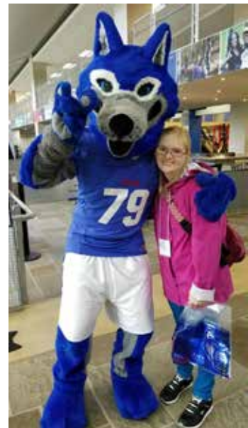
Project WOLVES at University of West Georgia is the newest inclusive college program in Georgia.

Georgia Inclusive Postsecondary Education Consortium is dedicated to ensuring that every Georgia student has access to learning after high school, regardless of intellectual or developmental disability. The Consortium is made up of colleges and universities, community support agencies, families and K-12 educators. Together, its mission ensures that every Georgia student with an intellectual or developmental disability has the opportunity to realize his or her full potential.