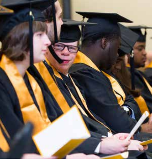
Proud graduates of Kennesaw State's inclusive college program