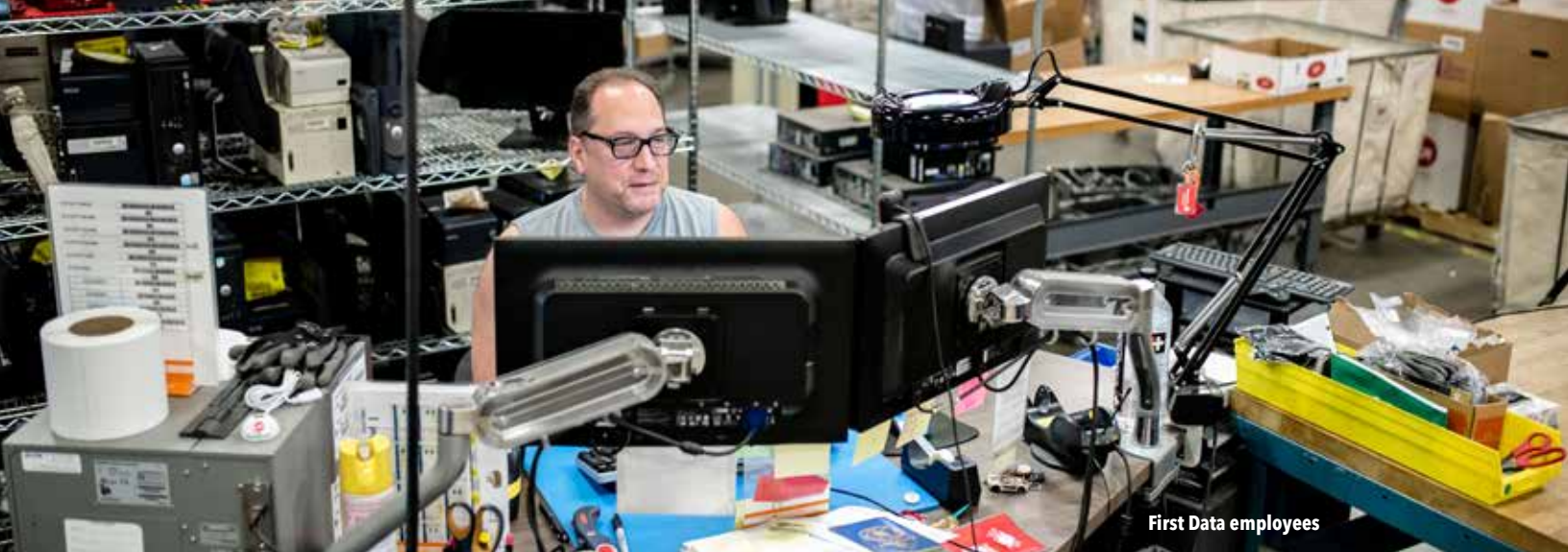
First Data employees