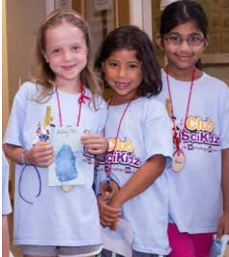
SciKidz campers find a sense of belonging, camaraderie and friendship.