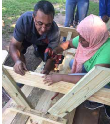
Adult volunteers and campers work together on a project for a hospitality house at Peacebuilders Camp.