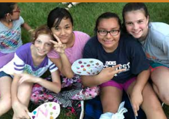
Children at the Peacebuilders Camp wait for fireworks to begin on July 4, 2017.