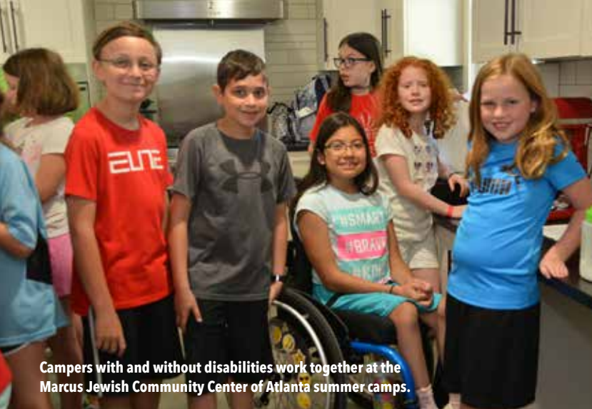
Camper with and without disabilities work together at the Marcus Jewish Community Center of Atlanta summer camps.