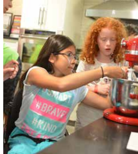
Campers with and without disabilities work on projects at the Marcus Jewish Community Center of Atlanta summer camps.

requests for things I cannot change. For example, if a gym echoes and a child cannot handle a lot of noise, camp may not be the best place.”