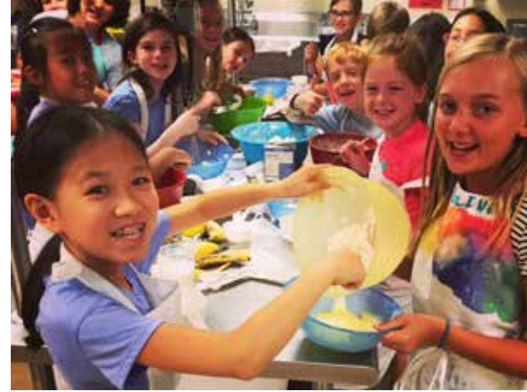
Campers with and without disabilities mix ingredients in a cooking class at SciKidz summer camp.