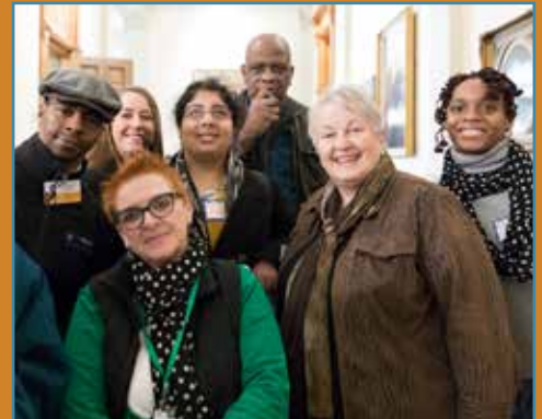
Senator Nan Orrock (D-Atlanta)