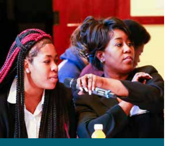
Taking the time to attend Advocacy Days and share your stories with legislators is one of the strongest and most personal forms of advocacy you can offer.