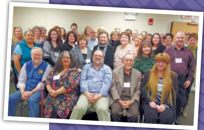
Developmental Disabilities Councils' Representatives at the Chicago meeting.

I think people are interested in REAL COMMUNITIES INITIATIVES because there are such a wide range of projects than can allow people to be creative in promoting welcoming communities, while connecting them with their neighbors.